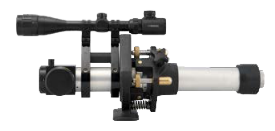
FP750 MAX. RANGE 750M RADIUS

MOBA's FP750 harnesses the accuracy and efficiency of laser technology to enable efficient and precise alignment between two reference points. Using a MOBA Laserguide laser receiver further simplifies the process by enabling the user to achieve automatic or manual machinery control.